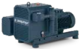
C-VLR ZEPHYR vacuum only