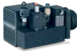
C-KLR ZEPHYR combination