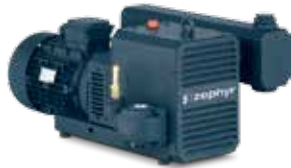
C-DLR ZEPHYR compressor